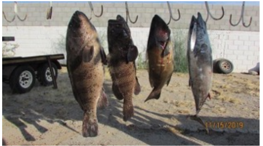
NIGHTWINGS 11/5 at Esteban and Colorado Risco, bonita, sardinera and pinta