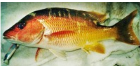
Pargo amarillo from Patos, unidentified boat