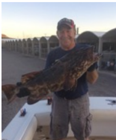
HILL BILLY YACHT at Queens Rock, baya (Baja) grouper