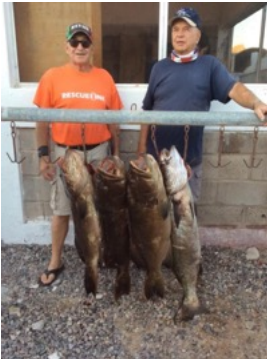
ROSIE boat, 11/4 at Willard, White Sea bass and yellowtail