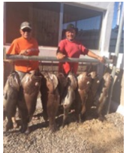
HILL BILLY YACHT/ROSIE at Angel de la Guarda 5/25