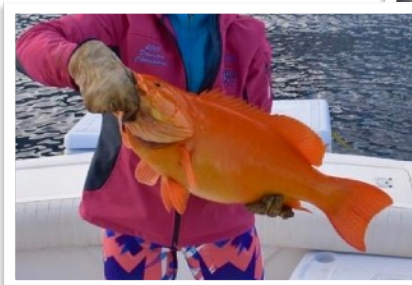
Golden Phase Leopard grouper (a one in a thousand mutant)