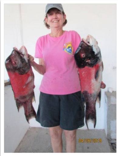
Sheephead from Esteban