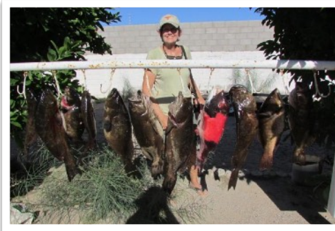
Baya or Baja grouper and Leopard Grouper