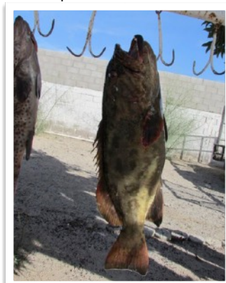
Baya or Baja grouper